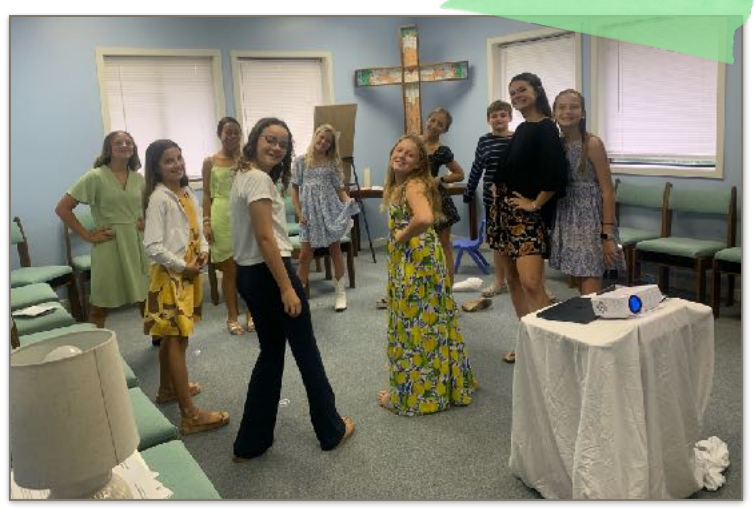
Pics from the Family Service & Middle School Youth Group